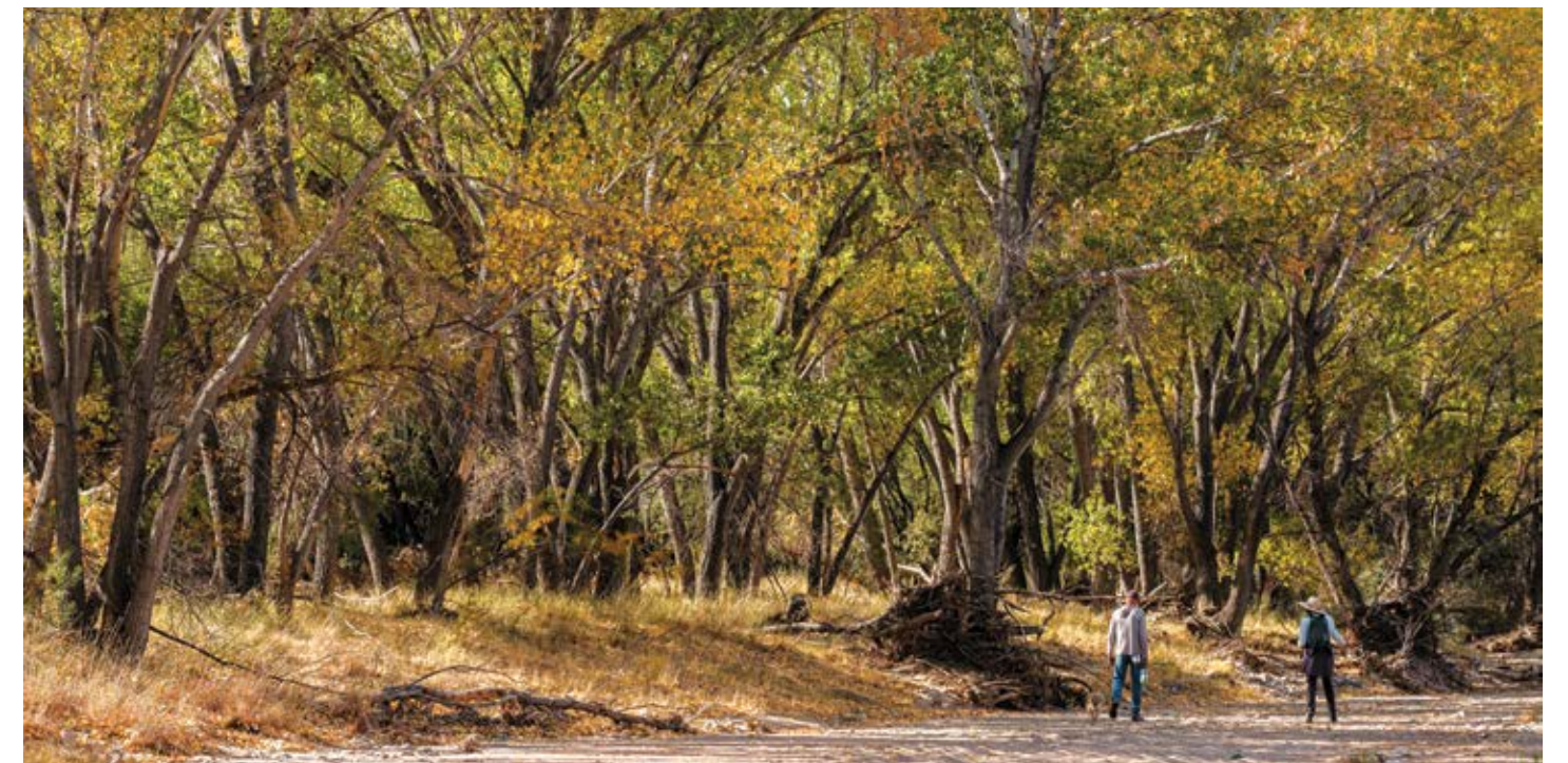
The riparian forest shows off fall colors along Ciénega Creek in Southern Arizona.

Thanks to strong donor support from the WMG community, we were able to overcome financial challenges during the pandemic and end the year with net positive revenue. Donations support all of our programs and are the primary funding for the River Run Network, Living Lab and Learning Center, as well as new family programming. Grants support river restoration projects, green stormwater infrastructure in limited income neighborhoods, and work with K-12 schools. Program income is from fee-based services such as our consulting, Green Living Co-op, and technical trainings.