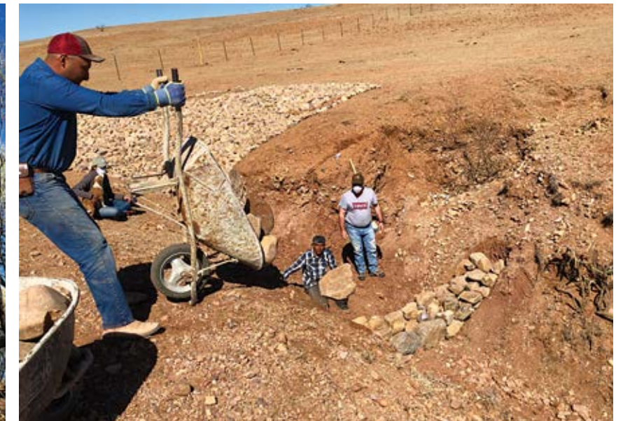
Installing rock structures to restore the rangeland and river.

Instalación de estructuras de piedra que ayuden a restaurar los pastizales y el río.